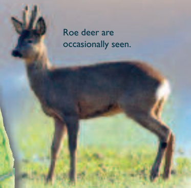
Roe deer are occasionally seen.

The route continues past farm buildings and then behind Marton Wood before bringing you onto Legram Lane. Look for the cemetery on your left which was once the site of Marton's church. It is now also a nature reserve.