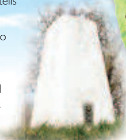
Great views can be had from the Trig Point.