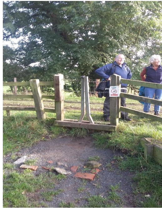
4 on map: stile at Myton Bridge (turn left here)