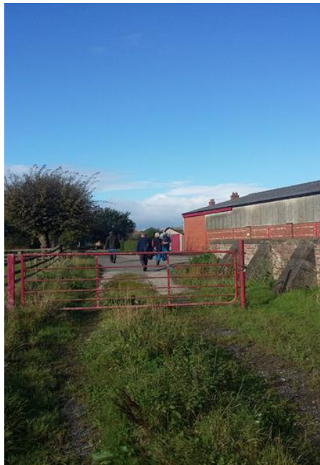
Clott Farm at start of Ellenthorpe Lane