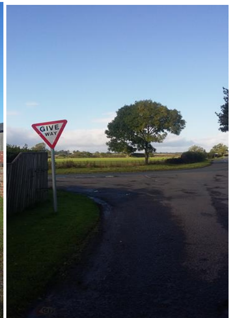
5 on map: turn left here and head for Milby