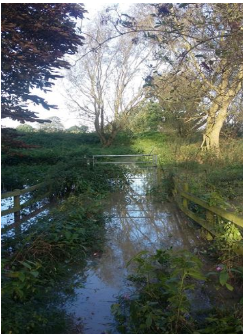
Path to Clott Farm (on a wet day!)