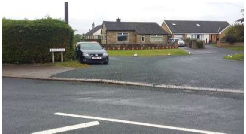
Back Lane, off Skelton Road: turn hard right up the lane