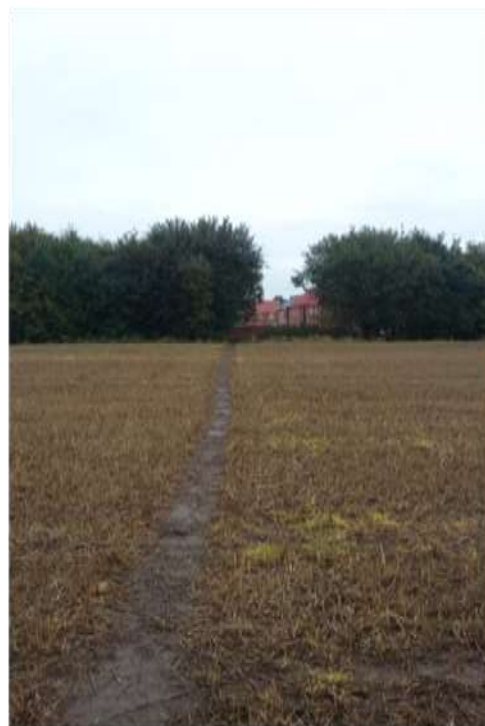
Point 4 on map: turn left when you reach the trees (Hockley Croft beyond)

OS Explorer 299, 1: 25 000 and/or Landranger 99, 1: 50 000 should be used in conjunction with the informal map above