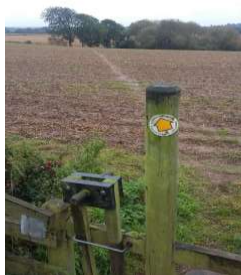
Start of path from Kirby Hill Church to Church Banks*