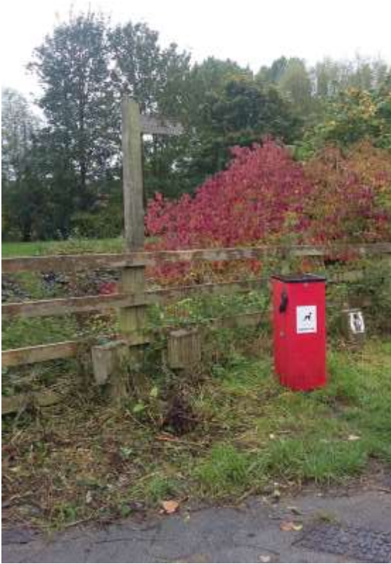
Near start – canal/riverside path finger post