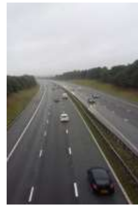
(S) From bridge over A1