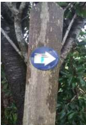
The way-marking sign for the walk

Key for pics below: (S) – standard, anticlockwise walk; (E) – extended walk