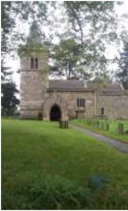
(S) Kirby Hill Church (4, above)