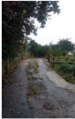
(S) Turn-off from Leeming Lane, leading to A1 crossing