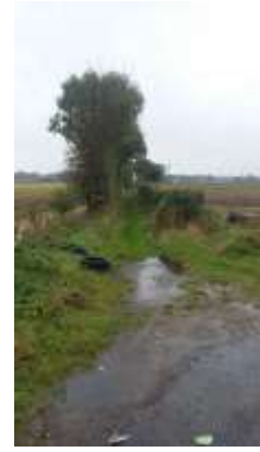
(S) "Green Lane" : Milby - Kirby Hill