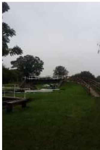
(S) Milby Lock (2, above)