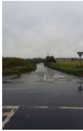
(E) Scaldhill Lane from Dishforth Rd