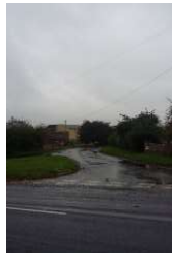
(S) Grange Farm, from the end of Tinkler Lane