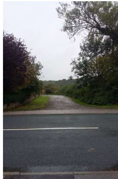
(S) Right turn to the riverbank path, near the end of the walk, just before The Fox & Hounds