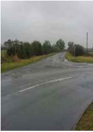
(E) Start of Scaldhill Lane from Helperby Rd