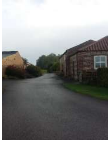
Follow the tarred road at 3