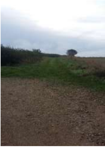
Straight ahead at 2B!