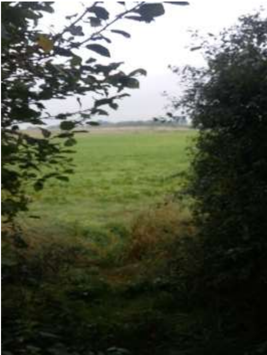
Unmarked gap in hedge at 7