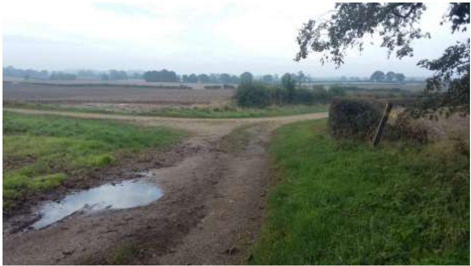
Left turn at 2A on map