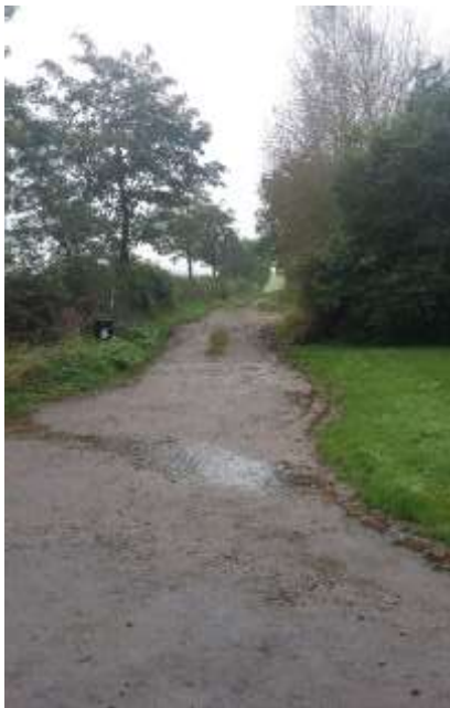
1 on map; start of walk proper