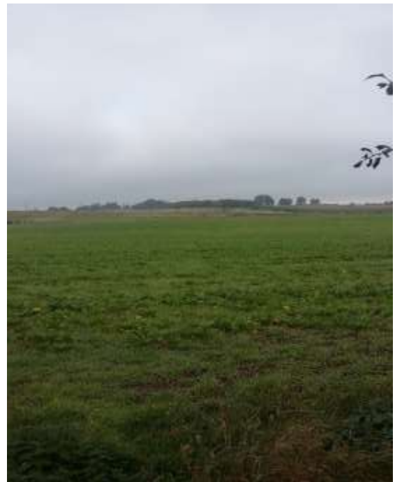
Towards Aldborough crossroads ( bearing 340); no visible path!*

*There is usually a path of some sort but, when the pic was taken in October, the crop had recently been harvested. There is a legal right of way (bridle path) from the unmarked gap in the hedge and the B6265