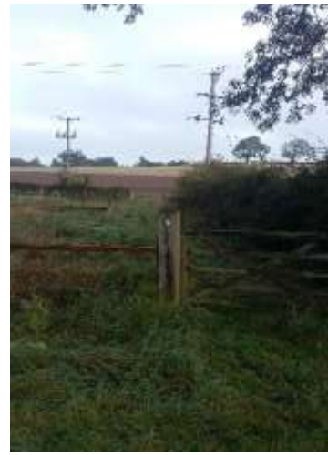
Alternative route at 4B