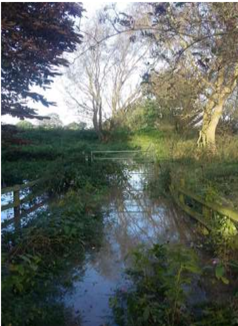
Path to Clott Farm (on a wet day!)