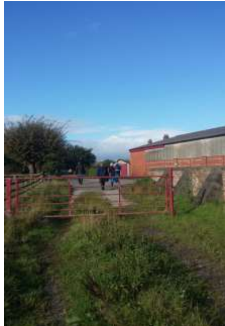
Clott Farm at start of Ellenthorpe Lane