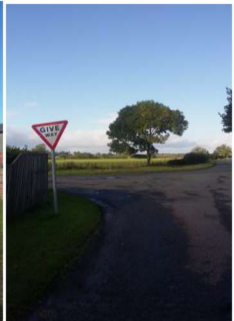
5 on map: turn left here and head for Milby