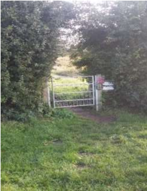
2 on map: gate near start of walk (Milby Lock)