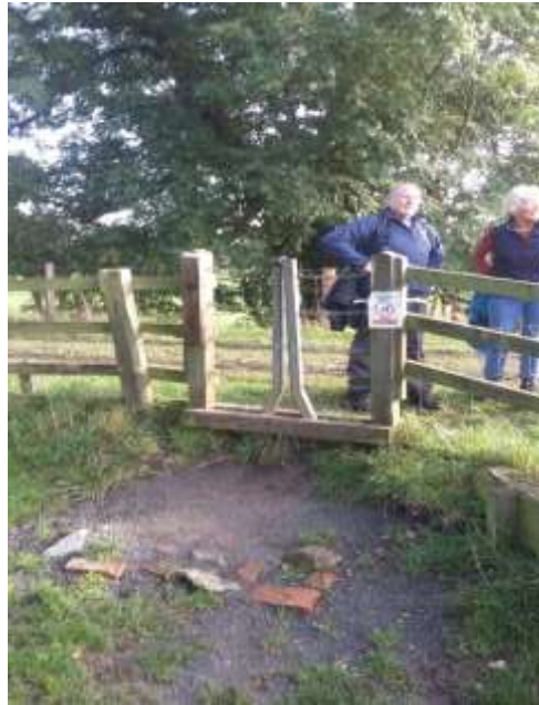
4 on map: stile at Myton Bridge (turn left here)