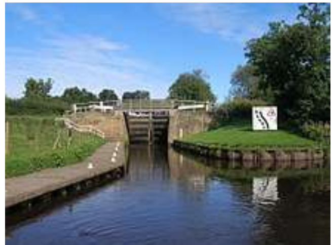
Westwick Lock (5 on map)