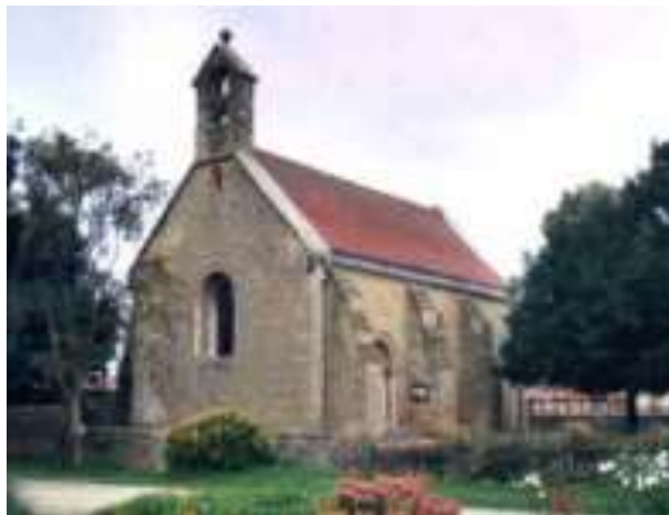
Path to river bank (2 on map) starts just to the right of the church