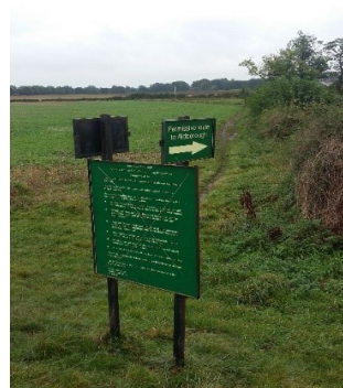
Start of "permissive path" section