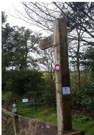
Start of riverside path